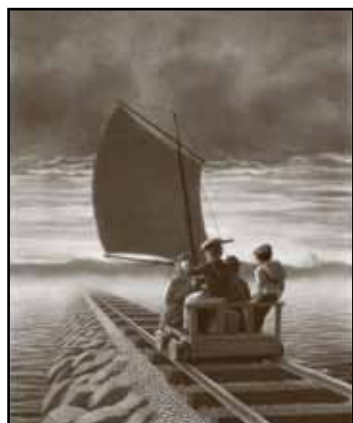
If there was an answer, he’d find it there.

What does it mean for Linus and Candy when the ocean liner shrinks small enough to fit in the molasses jar?