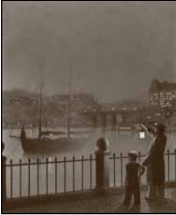
He swung his lantern three times and slowly the schooner appeared.