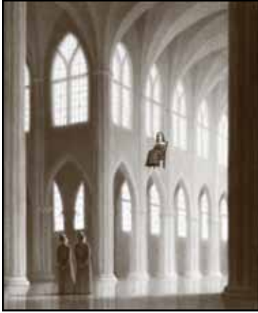
The fifth one ended up in France.