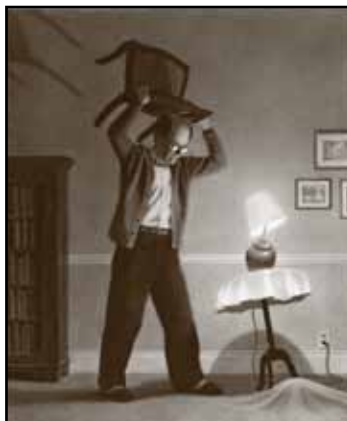
Two weeks passed and it happened again.

What do you think Archie will find if he goes to the park tomorrow to look in the bushes?