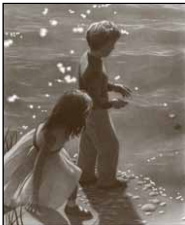
He threw with all his might, but the third stone came skipping back.

What do you think Mary Elizabeth will do to Timmy and Tina?