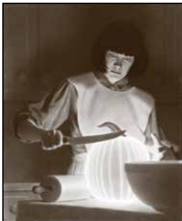
She lowered the knife and it grew even brighter.

Pearlie believes the break in the wallpaper pattern is proof of something. What do you think it is proof of?