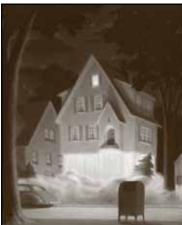
It was perfect lift-off.