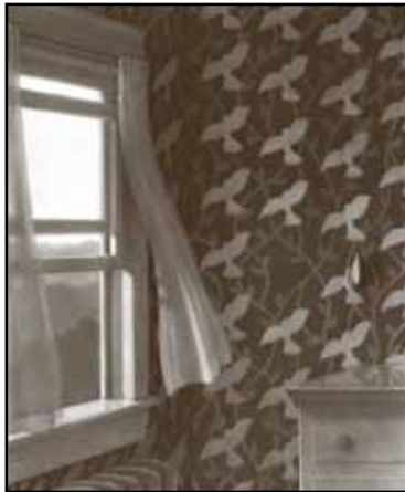
It all began when someone left the window open.