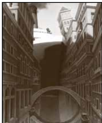
Even with her mighty engines in reverse, the ocean liner was pulled further and further into the canal.