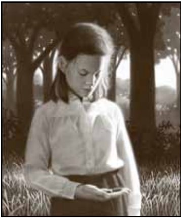
She knew it was time to send them back. The caterpillars softly wiggled in her hand, spelling out “goodbye.”