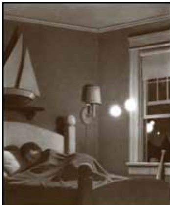
A tiny voice asked, “Is he the one?”

What do you think of Mr. Snicket’s theory regarding Burdick’s disappearance and authorship of the stories? Is it sound? Do you have an alternative theory?