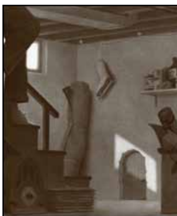
His heart was pounding. He was sure he had seen the doorknob turn.

What answer do you think Gilbert will find in the “infinite sideways” (p. 58)?