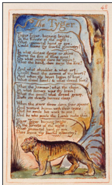
“The Tyger” by William Blake

By William Blake (Public Domain) via Wikimedia Commons