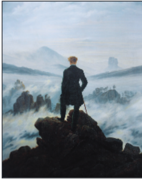
"Wanderer Above the Sea" by Caspar David Friedrich