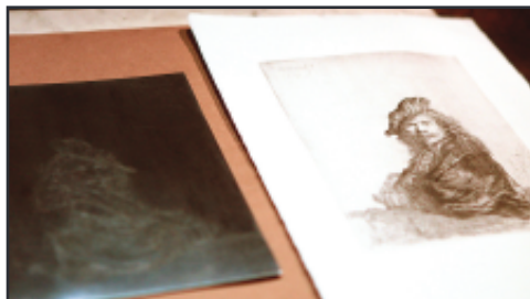
This shows an engraving (left) and a print from the engraving (right)