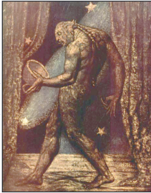
“Ghost of a Flea” by William Blake