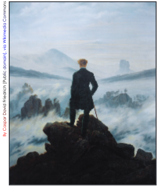
By Caspar David Friedrich