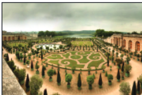
A garden at Versailles

By Panoramas via Flickr.com NoDeriv 2.0 Generic (CC BY-ND 2.0)