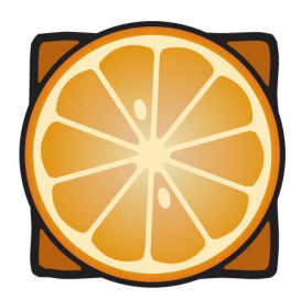
sap: the liquid inside a plant; can be watery or thick and sticky like syrup

pulp: the soft, inside part of a fruit or vegetable