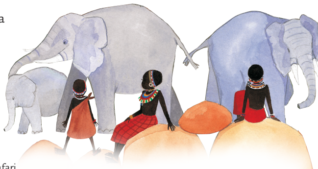
from We All Went on Safari

Zawadi ni tunda la moyo – A gift is a fruit from the heart