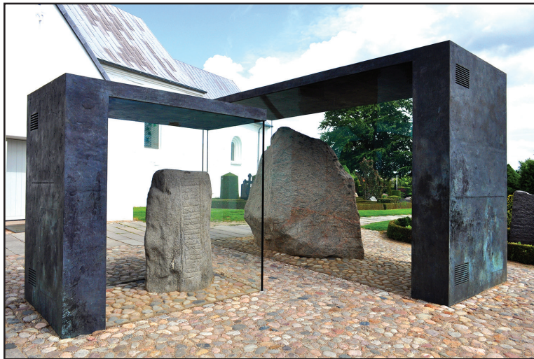
The Jelling Stones

Harald was the first Viking king to bring both Christianity and unity to the Viking people. And it seems that Christianity and tribal unity brought an end to the Viking Age. Therefore, you might say that King Harald Bluetooth ushered in the end of the Viking Age. Before 1050CE, most Vikings were pagans who worshiped gods like Odin and Thor. King Harald was one of the first well-respected Viking kings to convert to Christianity. He encouraged the people he ruled over to convert to Christianity as well. Then he started to unite the other Viking tribes in Denmark. Harald Bluetooth became known as the king that united Denmark. Then, so the rest of the world would remember how great he was, he erected a monument to himself in Jelling (YELL-ing), Denmark known as the Jelling Stones. The stones feature Viking runes (a type of writing that uses symbols) that describe the great deeds of the fantastic King Harald.