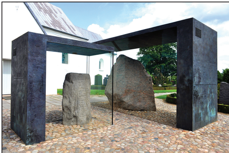
The Jelling Stones

Harald was the first Viking king to bring both Christianity and unity to the Viking people. And it seems that Christianity and tribal unity brought an end to the Viking Age. Therefore, you might say that King Harald Bluetooth ushered in the end of the Viking Age. Before 1050CE, most Vikings were pagans who worshiped gods like Odin and Thor. King Harald was one of the first well-respected Viking kings to convert to Christianity. He encouraged the people he ruled over to convert to Christianity as well. Then he started to unite the other Viking tribes in Denmark. He became known as the king that united Denmark. Then, so the rest of the world would remember how great he was, he erected a monument to himself in Jelling (YELL-ing), Denmark known as the Jelling Stones. The stones feature Viking runes (a type of writing that uses symbols) that describe the great deeds of the fantastic King Harald.