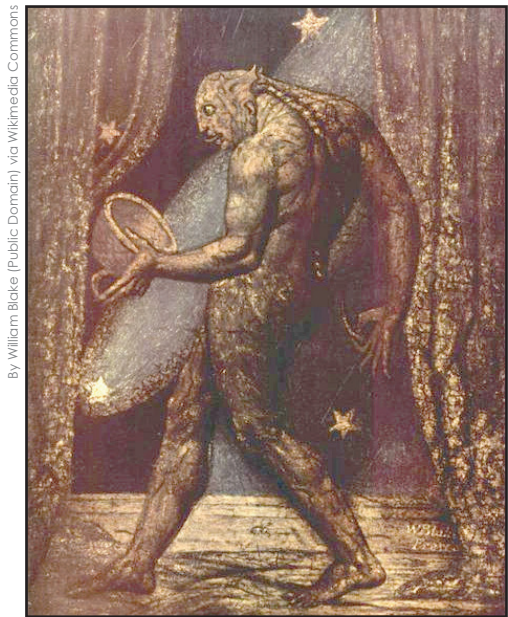
"Ghost of a Flea" by William Blake

When it comes to his visions, Blake claimed to have had a lot of them. He said that he had his first vision when he was four years old. At age 10, Blake claimed to have seen a tree full of angels. When his brother died, Blake claims to have seen his brother's spirit rising from his body. Later, he created many paintings of people long dead or of unreal creatures. He claimed that