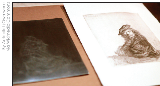
This shows an engraving (left) and a print from the engraving (right)

William Blake was both an artist and a writer. He