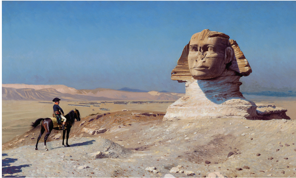
A painting by Jean-Léon Gérôme [Public domain]