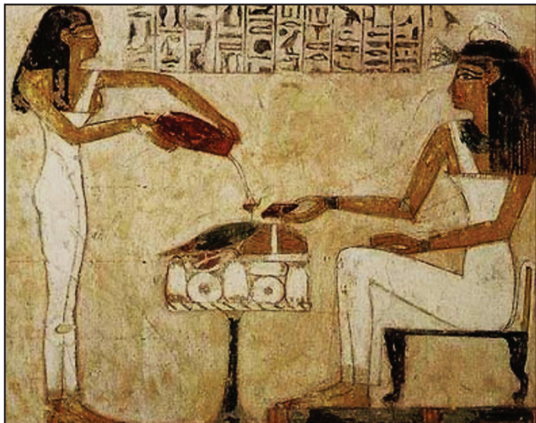
Egyptian hieroglyphics appear at the top of the picture

Egyptian hieroglyphics are a special form of writing. Hieroglyphics use simple pictures called glyphs. The glyphs stand for different words. In order to read hieroglyphics, you must know the meaning of each glyph. The writing you are reading right now uses letters to form words. The letters come from an alphabet and each one makes a sound. You can put different letters together to form the sounds of the words we speak. The Greeks used a writing system with an alphabet, too.