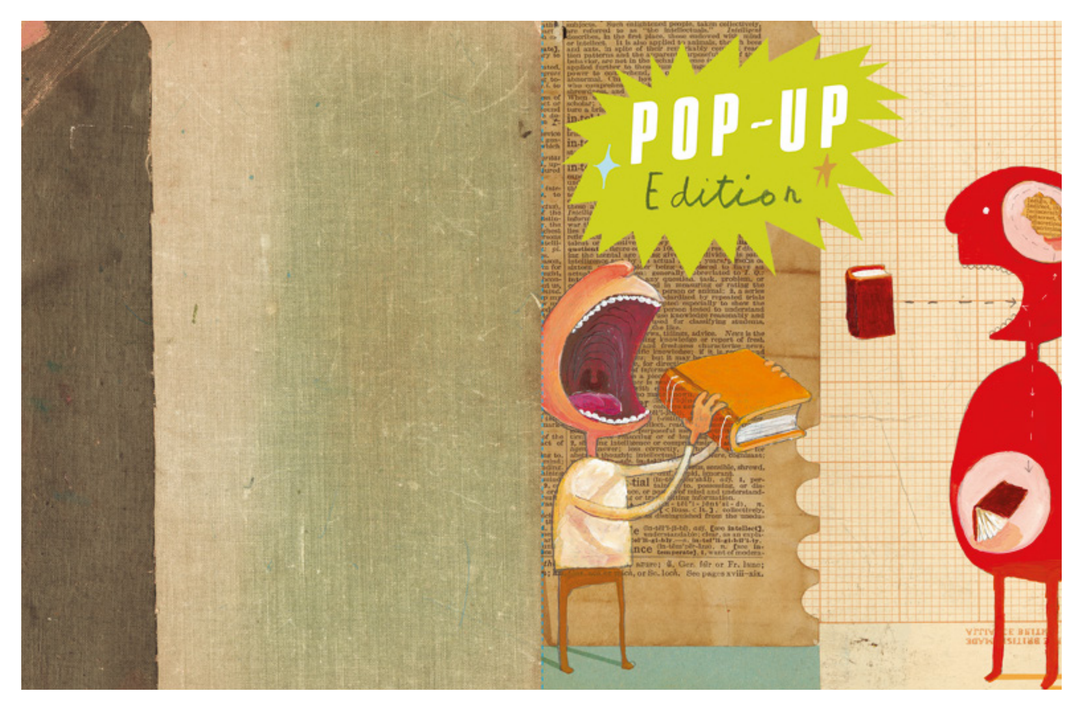
Discover more fun and games at www. oliver Jeffers World. com