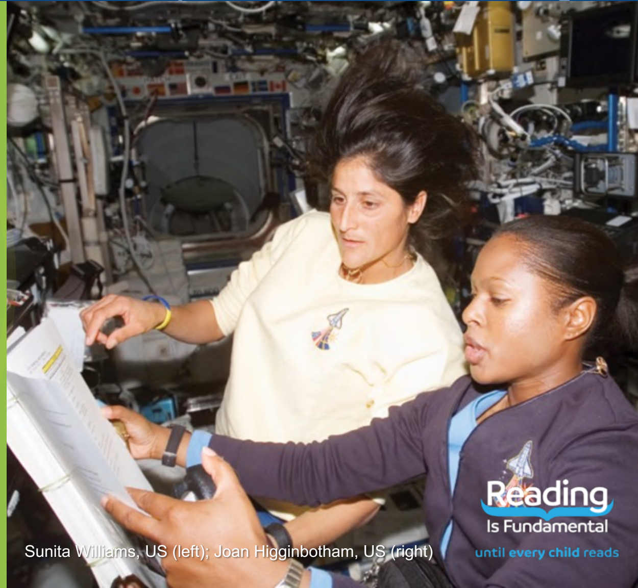
Sunita Williams, US (left); Joan Higginbotham, US (right)

A Astronauts Zoom! has 38 different women and men astronauts. They are scientists, engineers, doctors and pilots. You can find all their names, and the countries they're from, in the back of the book. And you can learn more about each one of them at nasa.gov .