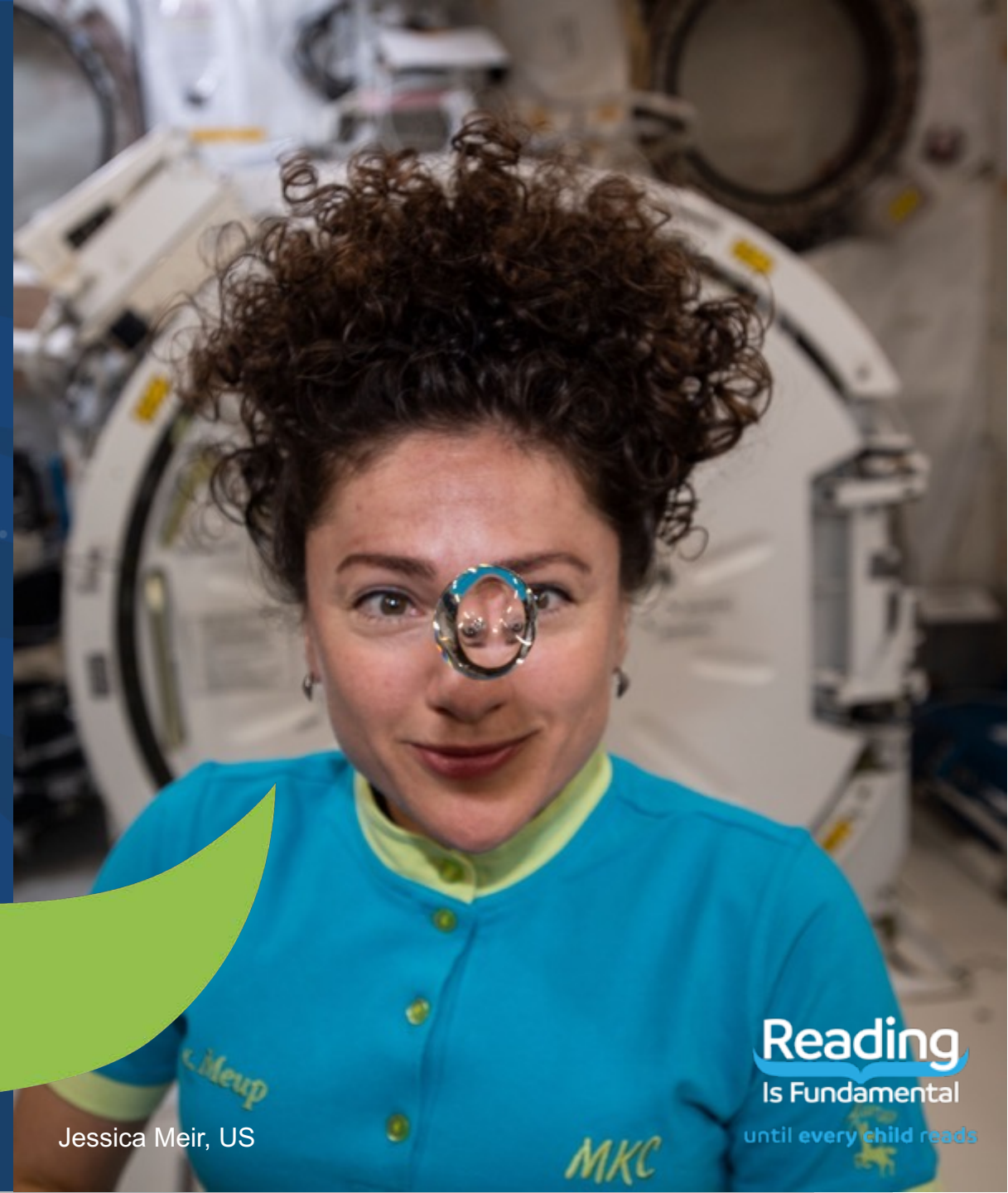
Jessica Meir, US

NASA.gov is an amazing resource for photos. I wanted pictures that told stories, with lots of color and even funny details like astronauts' pizzas floating above their table. A lot of photos in the book show astronauts smiling. Living and working in space is very demanding, but astronauts love what they do.