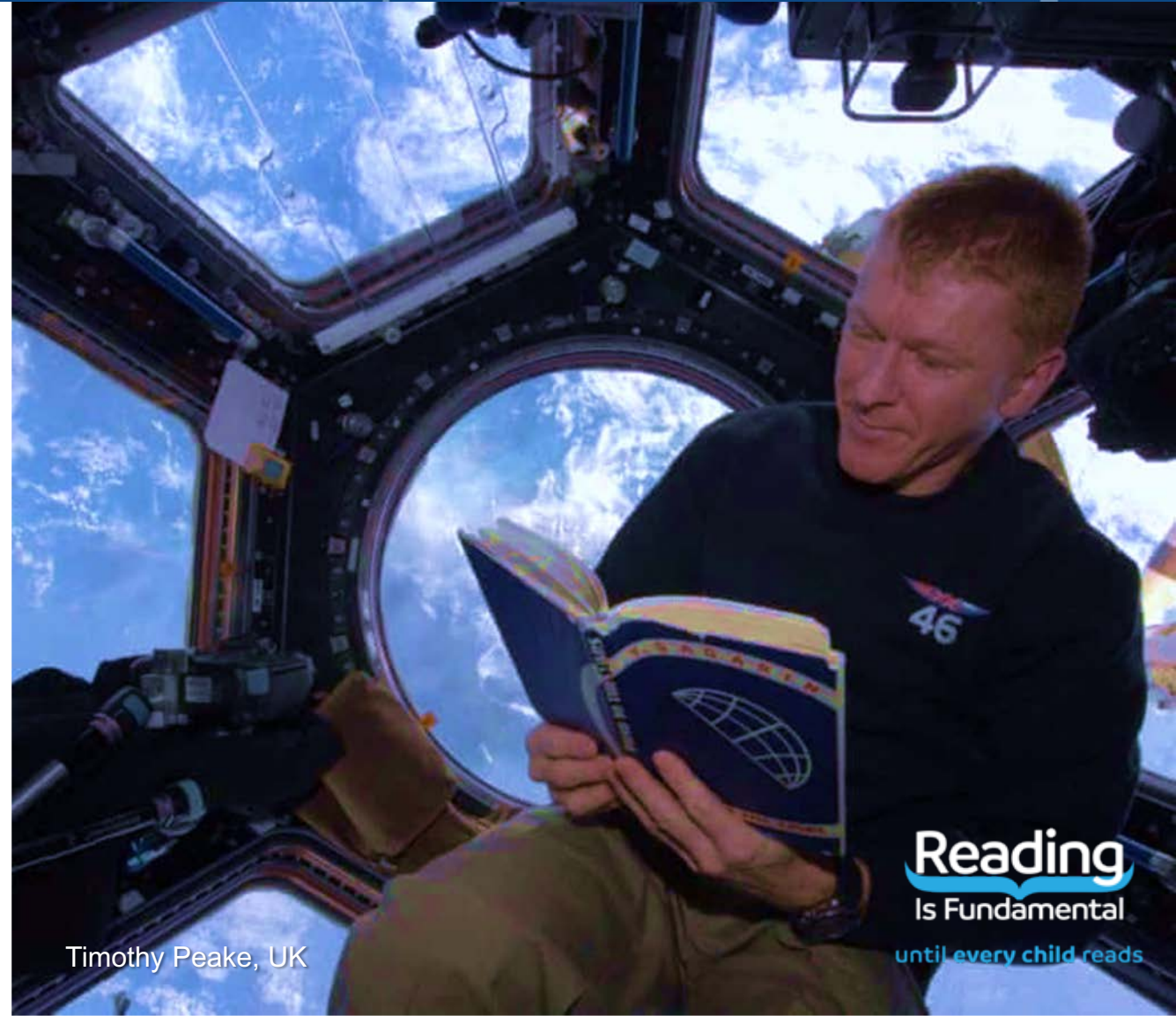
Timothy Peake, UK

Astronauts train a long time on Earth before their space missions. One way they prepare for living and working in space is by practicing in a giant pool on Earth. The pool has a special practice model of the International Space Station under the water. You can see astronauts training in the book's backmatter.